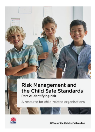
Risk Management and the Child Safe Standards Part 2: Identifying risk