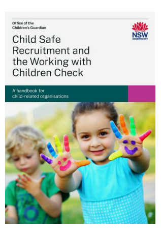
Child Safe Recruitment and the Working with Children Check