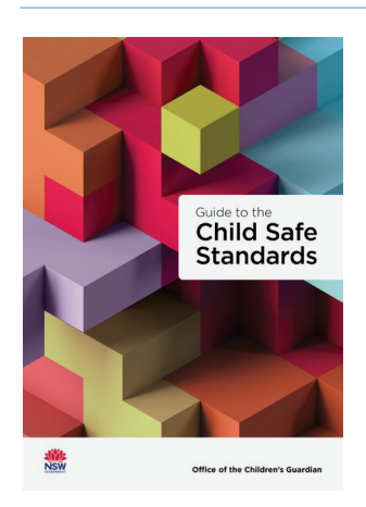
Guide to the Child Safe Standards