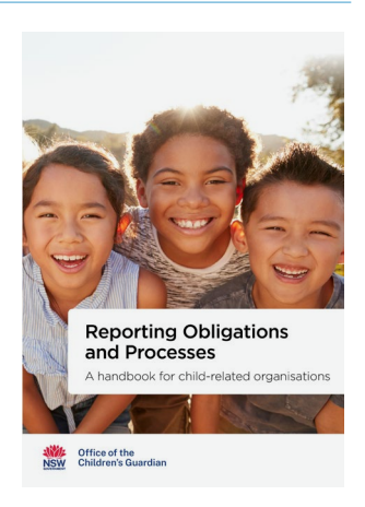
Reporting Obligations and Processes