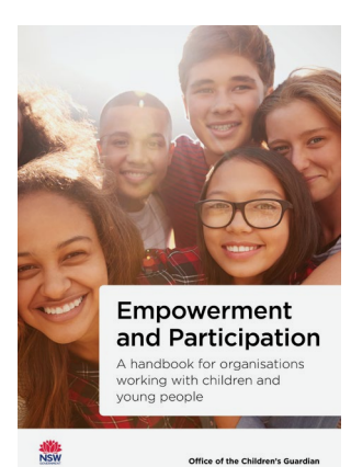
Empowerment and Participation