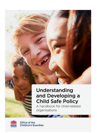
Understanding and Developing a Child Safe Policy