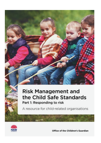
Risk Management and the Child Safe Standards Part 1: Responding to risk