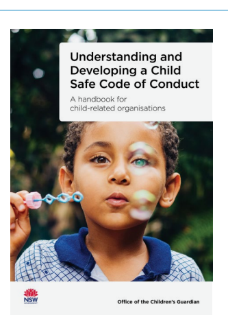
Understanding and Developing a Child Safe Code of Conduct